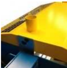
Extraction point for smoke and dust

The updated PalletSaw is equipped with several points for extracting smoke, shavings and dust. As a result, you will not only have savings on your expenses but also lesser smoke and dust. The dust extraction point can be connected to either a central dust extraction system or a stand alone unit which Cekamon Saws also offers in its product range. Wearing facemasks is with Cekamon Saws from now on needless. For information and quotation. Click here