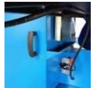
Extraction point for smoke, dust and sawdust

The updated PalletSaw is equipped with several points for extracting smoke, shavings and dust. As a result, you will not only have savings on your expenses but also lesser smoke and dust. The dust extraction point can be connected to either a central dust extraction system or a stand alone unit which Cekamon Saws also offers in its product range. Wearing facemasks is with Cekamon Saws from now on needless. For information and quotation. Click here