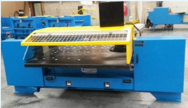
Year of construction November 2012

This machine (original photo) is equipped with the following options